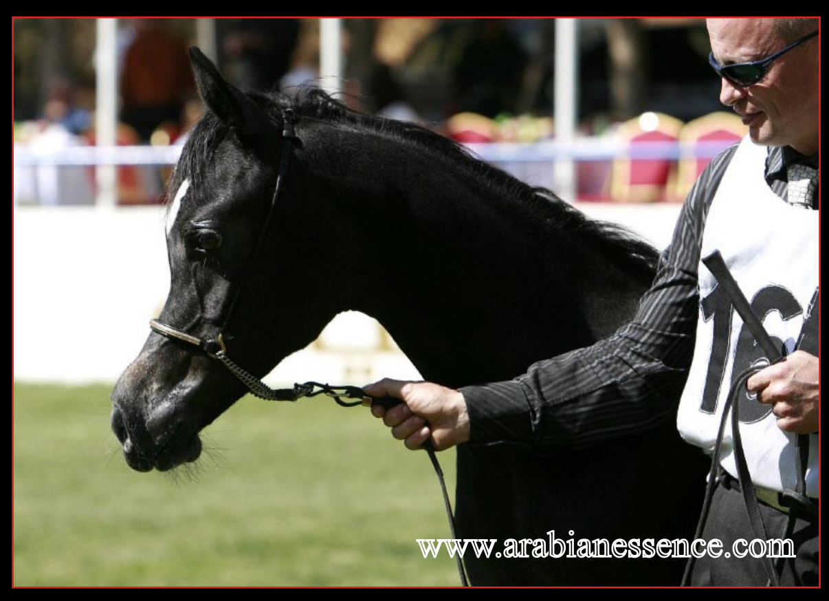
Best Female Head: Hoore (Monarcos DD.x Hasanaat Al Haneefah) owned by Al Mohamadia Stud

Crown Muscosa) bred in Germany and owned by the Amman Stables Jordan. I was invited to present the awards in this class and just missed a good back hander from both barrels from the the winner who was still very full of himself!! The last class of the day was the Junior Liberty class always fun to watch. The winner was Ibn Anmenes (Laman HPV x Anmenes) with Shumookh (Hlayyil Ramadan x Shaafi'ah) in secondplace. Then it was back to the hotel for a good dinner