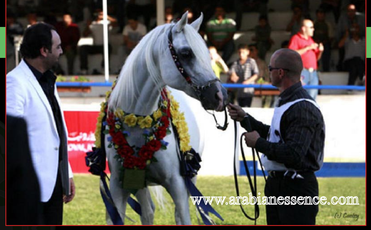
Champion Best Male Head: Hlayyil Ramadan (Kamar El Zaman x Haboub) owned and bred by The Royal Stables

the epitome of a classic Arabian head. In Reserve was Monarcos LL (Psytadel x Monogrammed Lady) another beautiful head, he was bred in Belgium and is owned by The Royal Stables. It had been a wonderful three days and sad to think it was over. After many goodbyes to new found friends, we went back to the hotel for a final dinner before we set off the next day for a two day sight seeing tour. I can't stress enough what a fabulous country Jordan is—so friendly and welcoming. We all decided that we wanted to come back next year and once again ignore US Nationals.