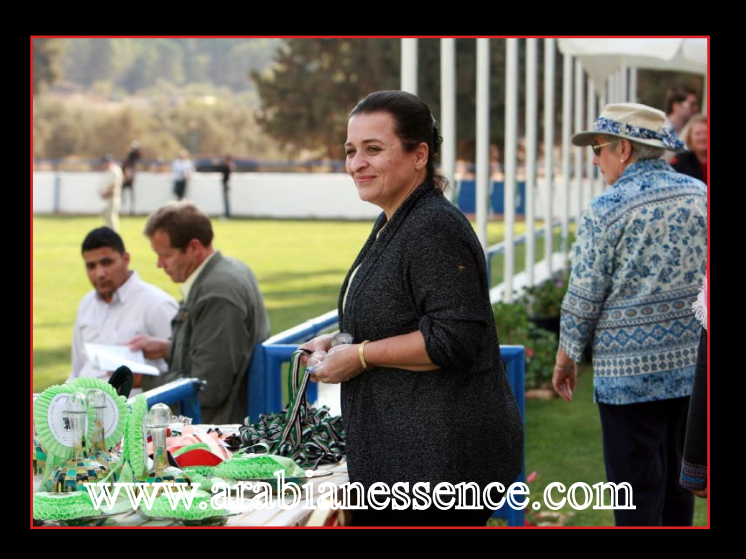
Princess Alia Al-Hussein