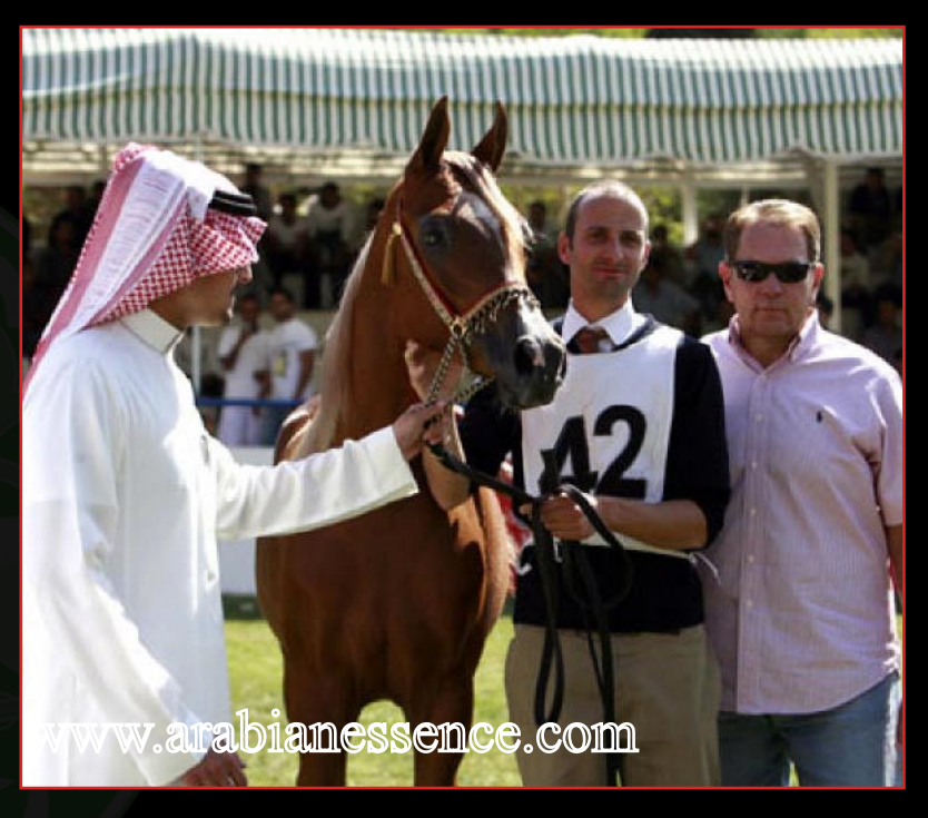
Reserve Champion Colt: Naif Al Mohamadia (Marwan Al Shagab x Maria Al Besson) owned by Al Mohamadia Stud

Crown Muscosa) bred in Germany and owned by the Amman Stables Jordan. I was invited to present the awards in this class and just missed a good back hander from both barrels from the the winner who was still very full of himself!! The last class of the day was the Junior Liberty class always fun to watch. The winner was Ibn Anmenes (Laman HPV x Anmenes) with Shumookh (Hlayyil Ramadan x Shaafi'ah) in secondplace. Then it was back to the hotel for a good dinner